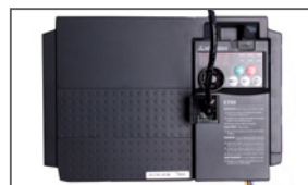
Variable frequency controller