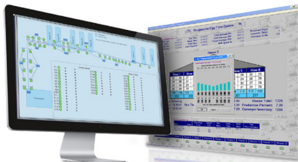
At-a-glance graphic displays of poultry house performance